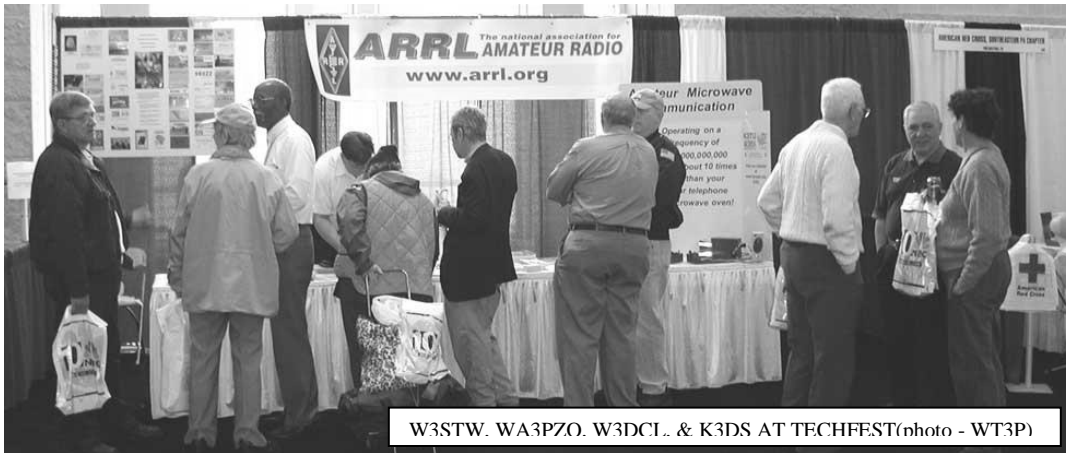
W3STW, WA3PZO, W3DCL, & K3DS AT TECHFEST (photo - WT3P)