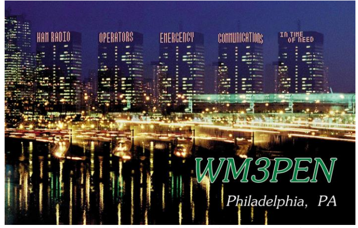
In 2015 WM3PEN joined 5 other stations in the United States as the Pope visited Philadelphia for the World Meeting of Families. The qsl card showed several locations that the Pope visited in Philadelphia.

In 1999 the FCC made vanity call signs available. WA3PZO immediately applied for WM3PEN. In 2006 WM3PEN was on the air as a special station to celebrate 100 years of voice over radio as part of the ARRL 'Hello' campaign.