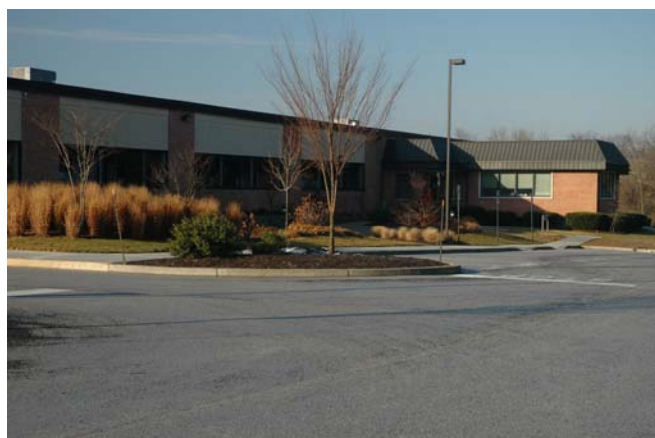
The FCC is one of the tenants of this Gettysburg office building.