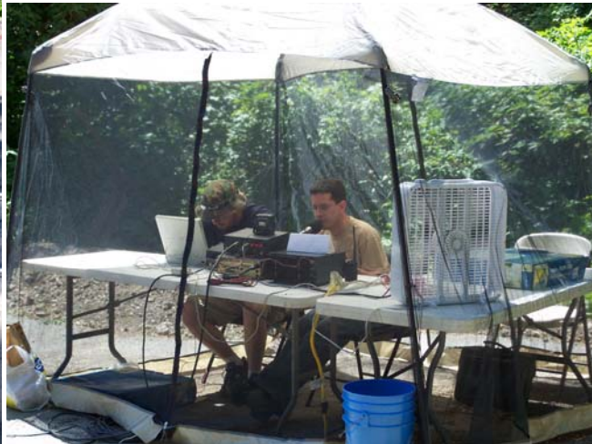
Field Day pictures