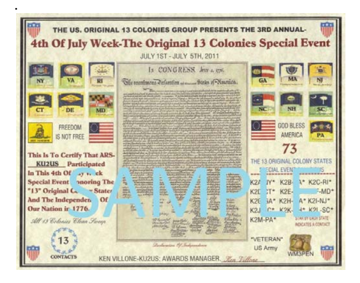
Stations could earn a certificate for working one station or having a clean sweep.