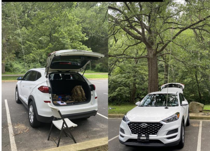
Andrew Chen - W3AWC