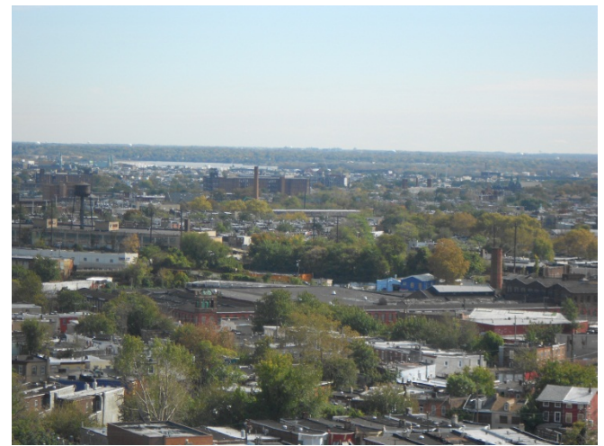
(Looking east towards NJ.)