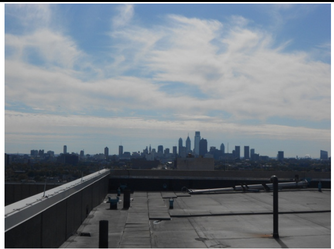
(Looking south towards center city)