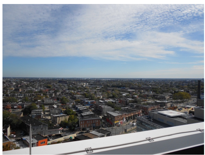
(Looking Northwest from repeater site)

Temple Backup Repeater Site pictures (See story page 1 – (Photos via K3RJC)