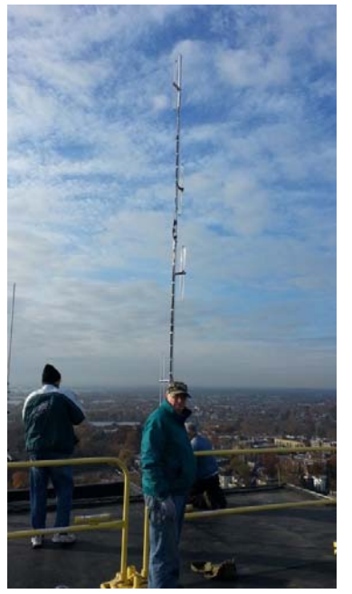
The WM3PEN Repeater antenna.

Inputs, outputs, satellite receivers, voters, cavities, controllers, are all parts of a repeater system. Ron will explain the workings of a repeater system and how it helps to extend the area you can talk to with your HT.